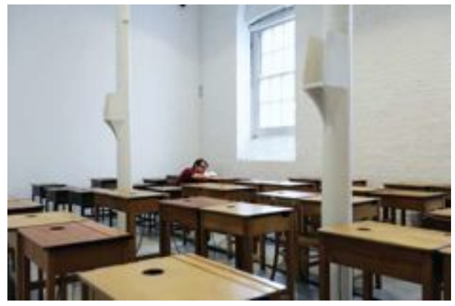
Suki Chan, A Hundred Seas Rising, 2012, installation view at Aspex Gallery, Portsmouth.

"The sea has always been an inspiration for me," Chan says, "and the chapter, 'The Sea Still Rises,' from Dickens's A Tale of Two Cities aroused my curiosity. . . . It